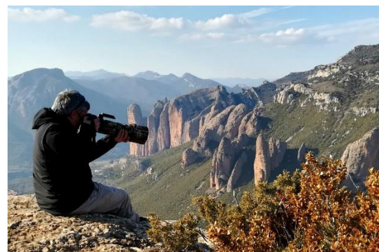
Los Mallos de Riglos