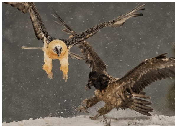
Adult and juvenile Bearded vultures